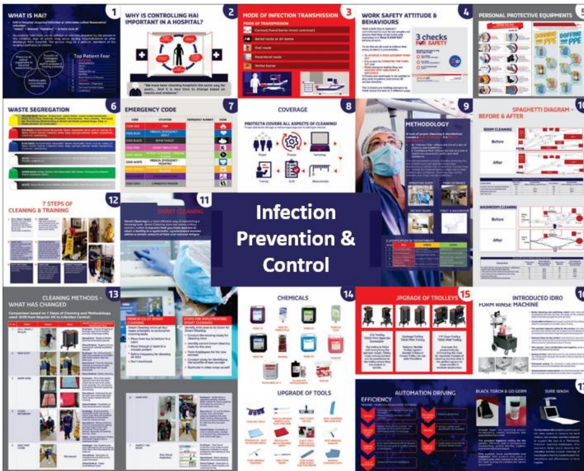
Fig: Example of Communication Board on Environmental Infection Control

Sodexo shall also establish a communication board, appropriate signage for Information, Education, Communication purposes which outlines the information shared above.