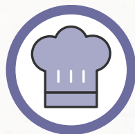
Signature Menus with Love of Food