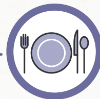
Healthy Balance with Mindful

Offered in conjunction with our digital ordering*, click and collect and payment apps, our sealed and safe food options create a contactless experience that doesn't sacrifice a great experience.